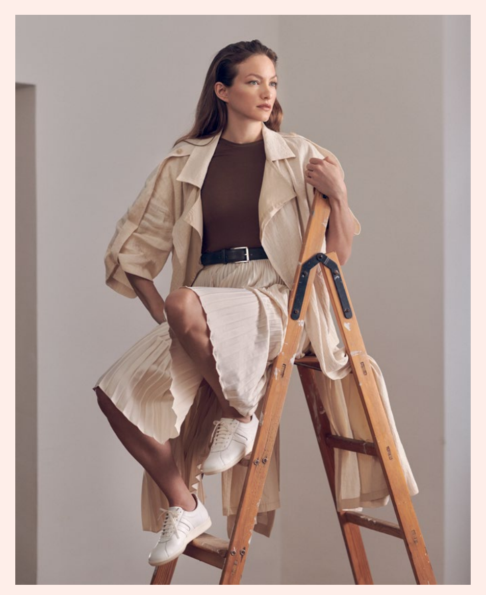
TRAINER Dolaro Grain, Offwhite T 582-KFP

We all have mountains to climb, our Trainers do it in style. Ludwig Reiter, by the way, is one of the few companies that offers only genuine leather lined sports shoes, except for the sole, nothing here is synthetic or plastic, so the shoes can be worn barefoot comfortably.