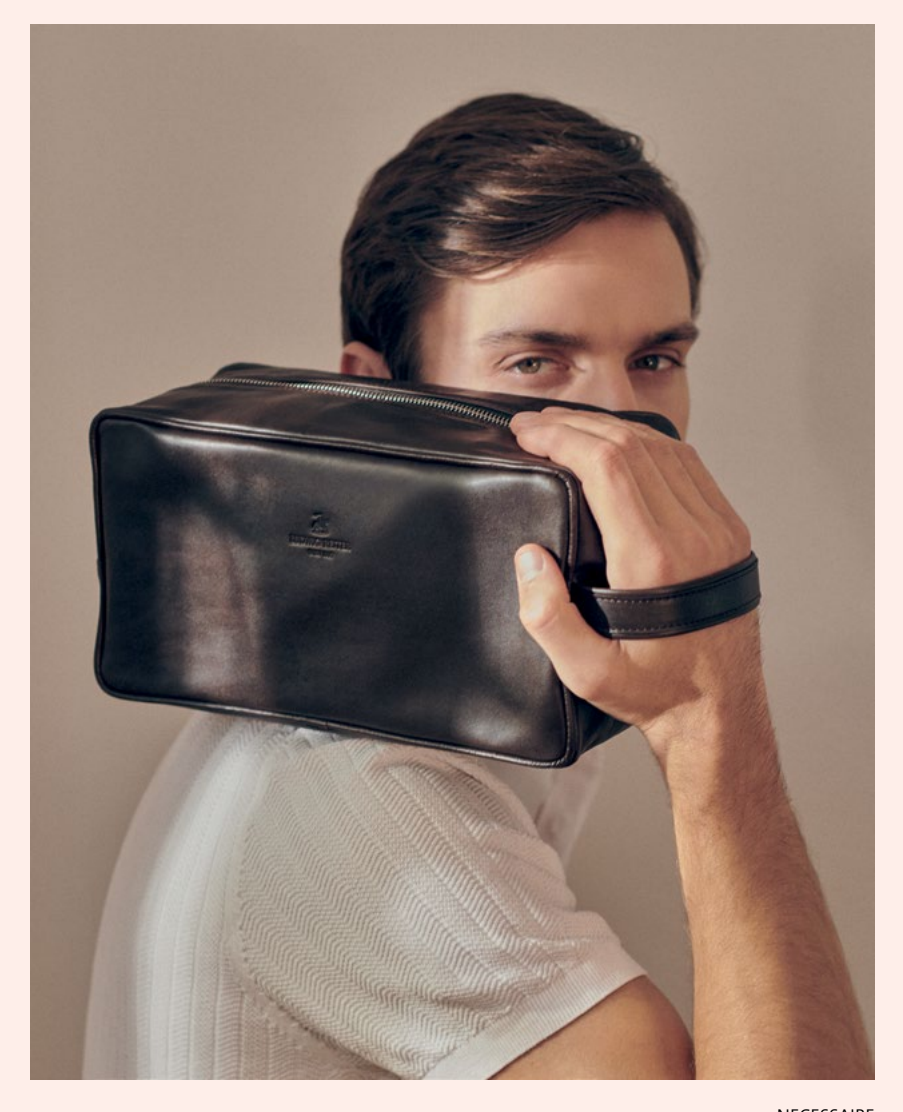
NECESSAIRE Horse Fronts, Mocca N T<sub>523</sub>-CDU