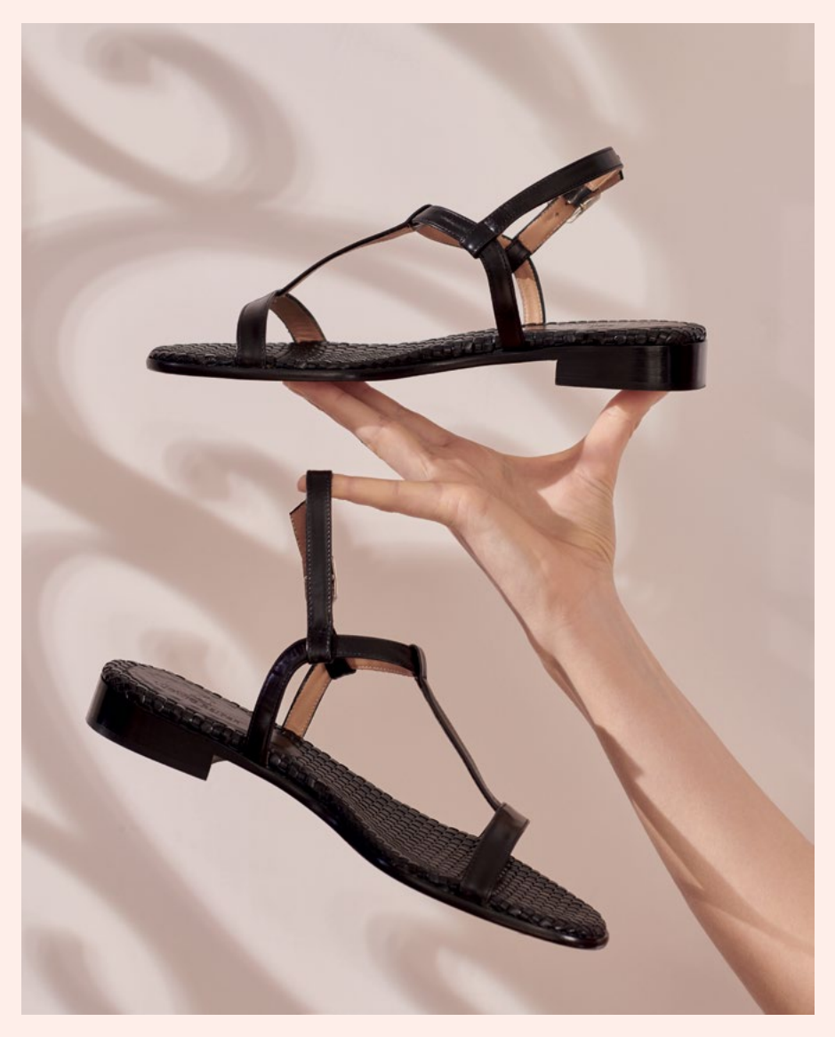
PAMINA Boxcalf, Woven Leather, Black D 8515-BS