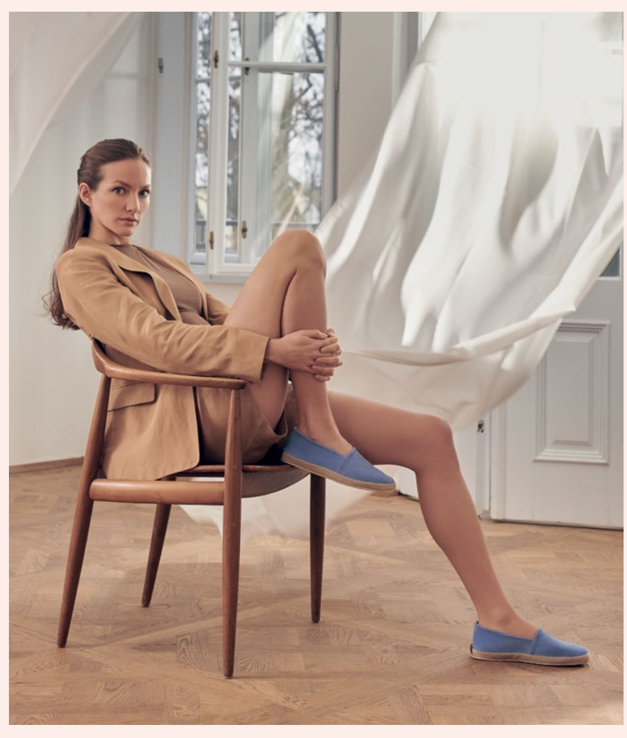
ESPADRILLO Suede, Azzurro T 501-VLB