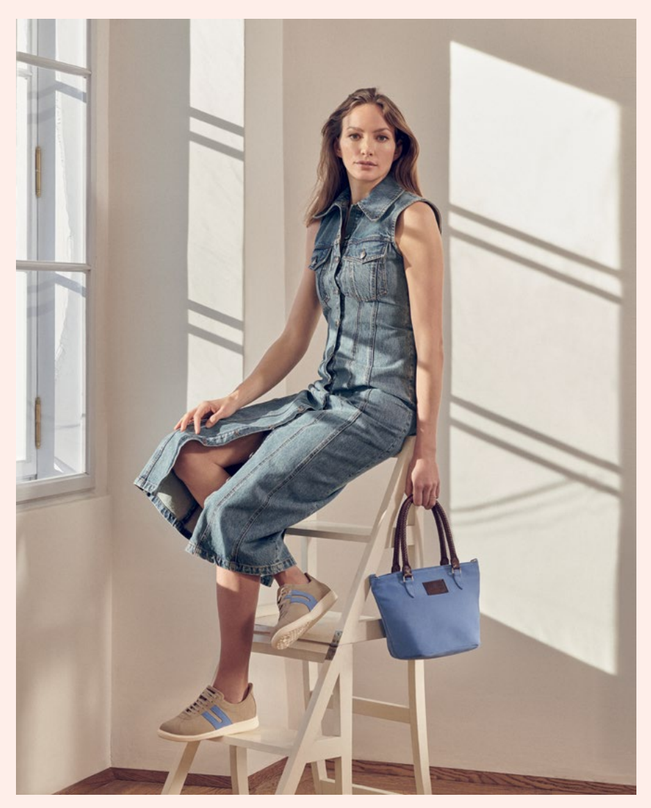
TRAINER Quarz / Azzurro, Suede T 582-VTQ-VLB