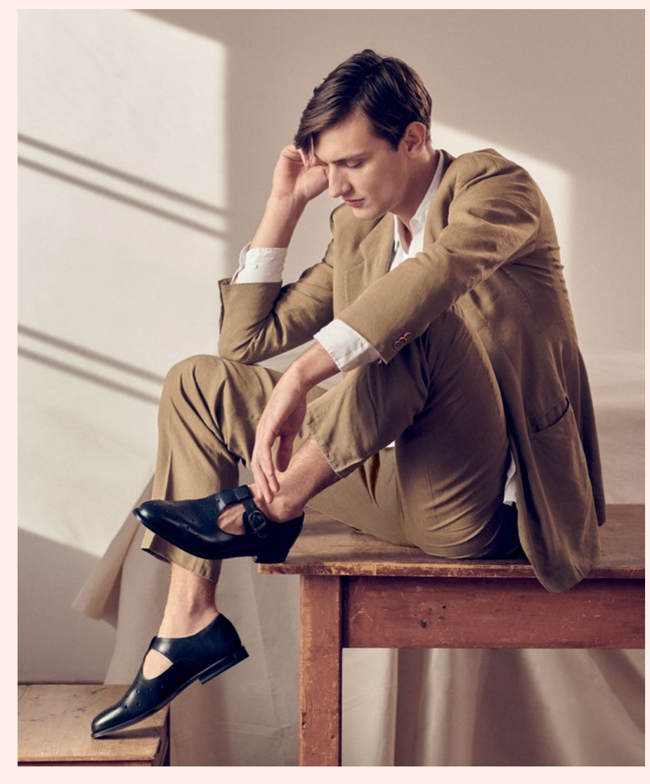
TRIESTINER Vintage Pullup, Black R 29-RPS.TF-3-S