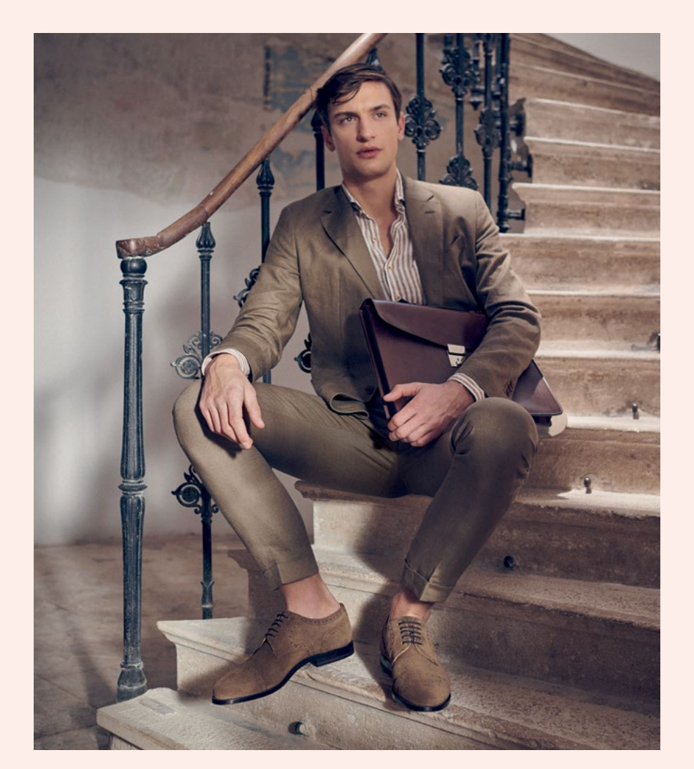
WIENER Suede, Safari R 13-VLJ.RF-3