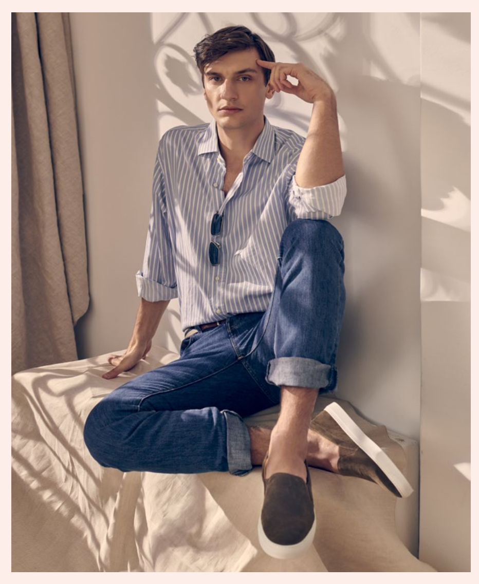
CAPRI Suede, Safari T 553-V∐