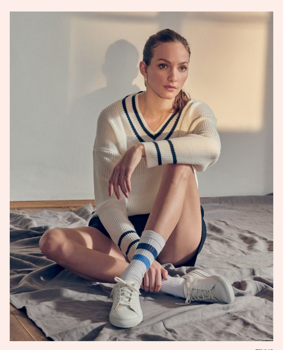
TENNIS Dolaro Grain, Offwhite T 560-KFP

In tennis, anything seems possible: high top or low top, forehand or backhand, inside in or inside out, old or new insole? The leather-covered insole is replaceable, a big point when it comes to the comfort and longevity of the shoes.