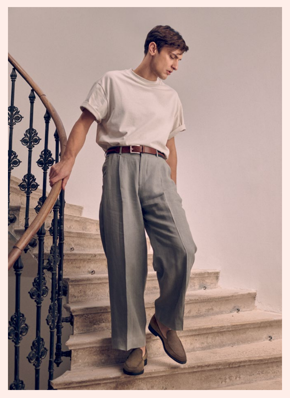
CAPRESE Suede, Safari S 409-VLJ-CS

Close your eyes: we walk through the enchanting cultural landscape of the Amalfi Coast, through olive groves and lemon gardens. On Capri, a sophisticated lifestyle is enjoyed, it is a joy to look at the colourful life. Tradition, joie de vivre and a value for things, that's also what Ludwig Reiter stands for.