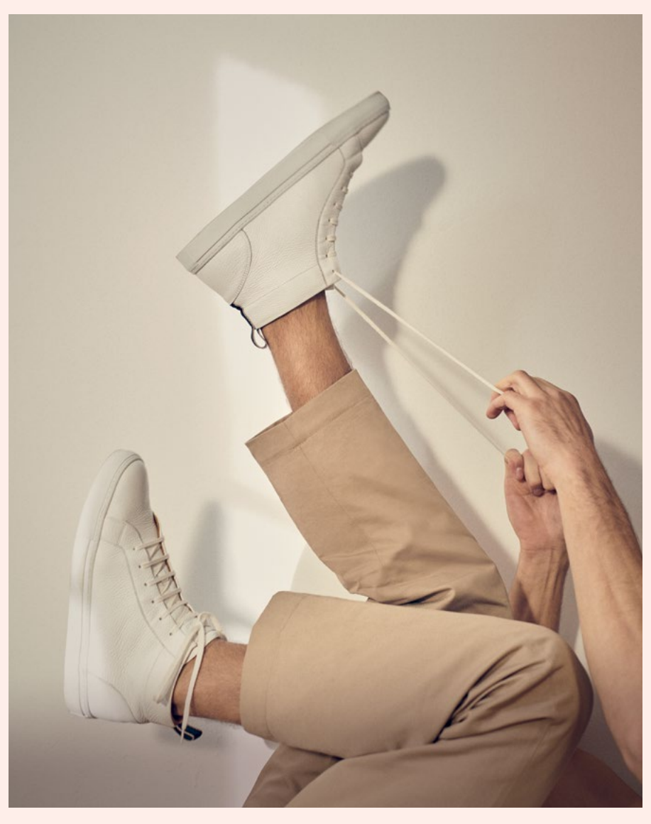
JUMPER Dolaro Grain, Offwhite T 566-KFP