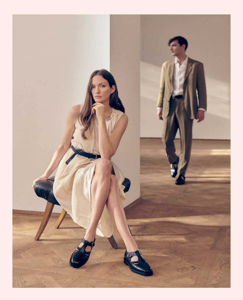
SPRING / SUMMER 2023