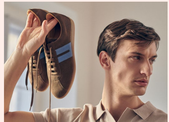
TRAINER Safari, Azzurro, Suede T582-VLJ-VLB.C

With a quick step, possibly in azure blue sneakers made of Italian suede, we are moving towards the wedding season. It should not go unmentioned that the newly renovated Süßenbrunn Castle can now also be rented as a wedding venue. Something borrowed, then!