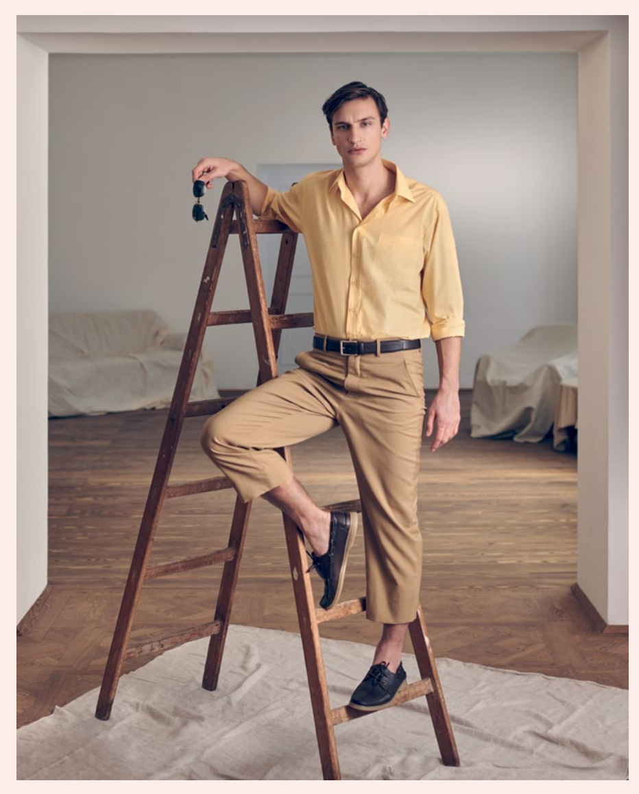
DOCKSIDER Horse Fronts, Mocca V H52-CD-BC