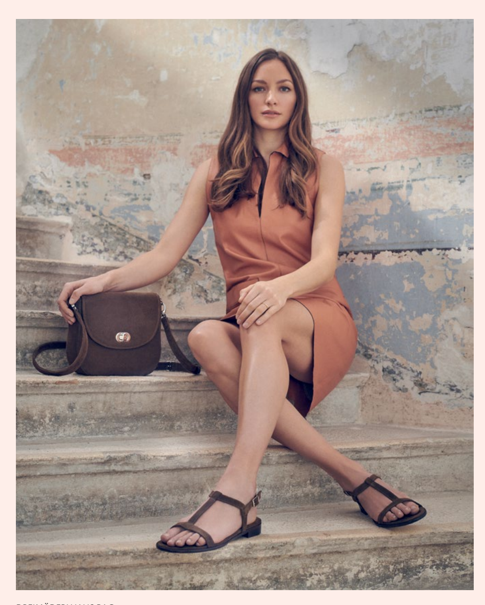
DREIMÄDERLHAUS BAG Suede, Safari N T773-VJ