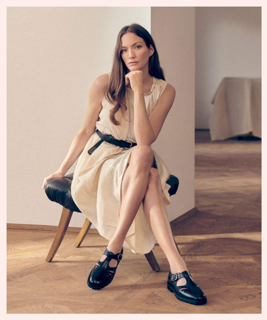
EMILIE Vintage Pullup, Black S 768-RPS-ES