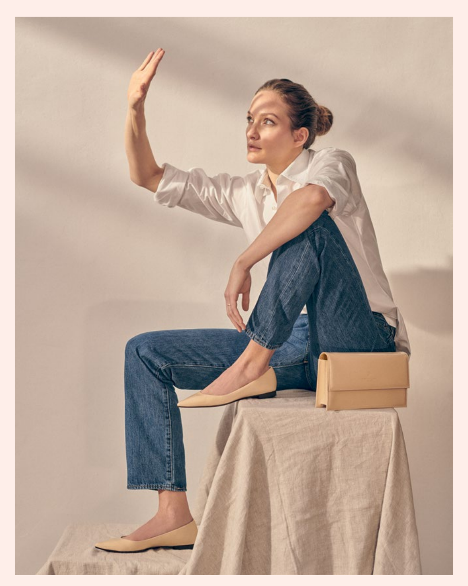
BALLERINA Coated Calfskin, Nude D 8811-LE

Given the shift in fashion towards more comfort, Cinderella's glass shoes seem pretty old-fashioned. Ludwig Reiter has the solution for the shoe that goes with every outfit and every occasion: nude-coloured ballerinas made of coated calfskin, complemented by a clutch. With her watch tucked inside, Cinderella would not have missed the time either.