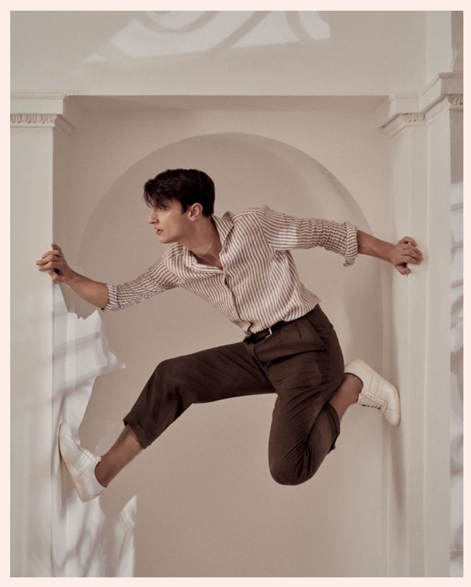
TRAINER Dolaro Grain, Offwhite T 582-KFP