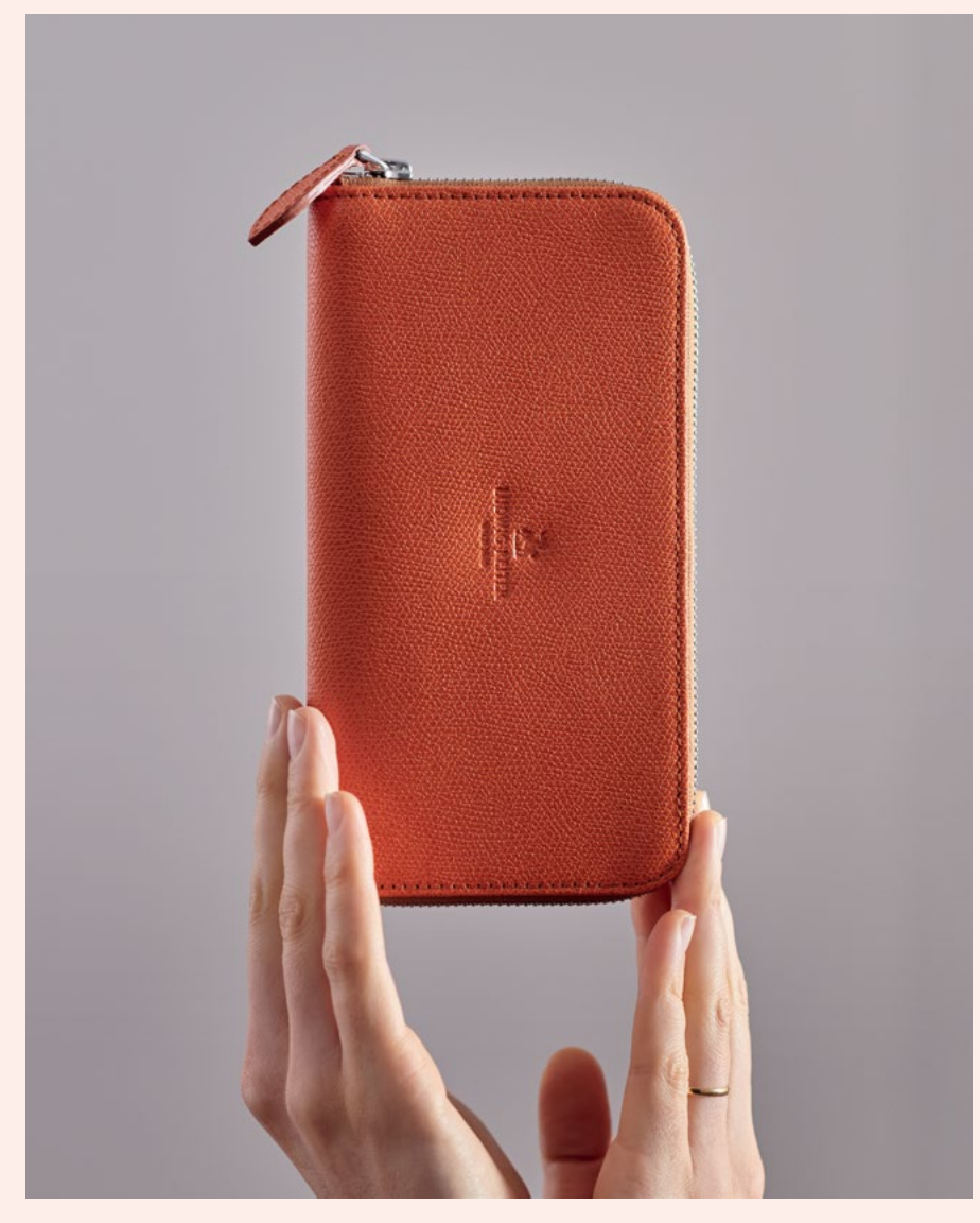
PORTEMONNAIE Grain Dauphin, Tangerine N T938-GDO