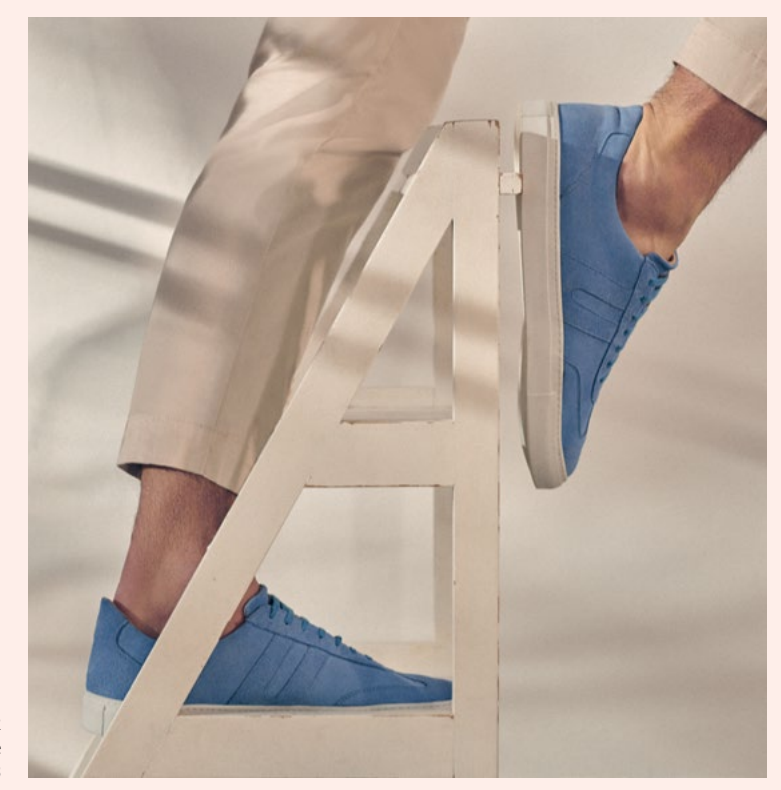
SKIPPER Azzurro, Suede T 555-VLB