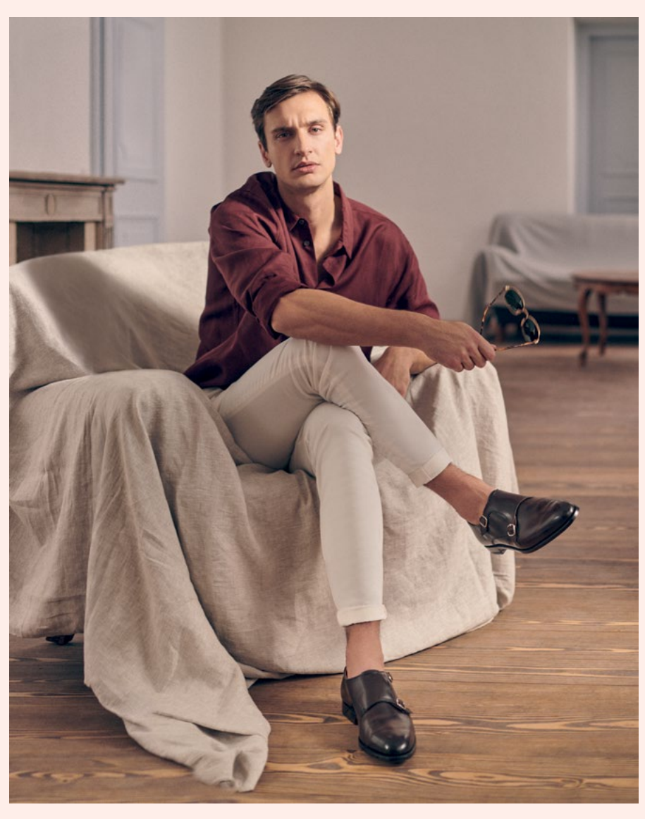
DOUBLE MONK Patina Calf, Mocca R 32-BPD.TF-3