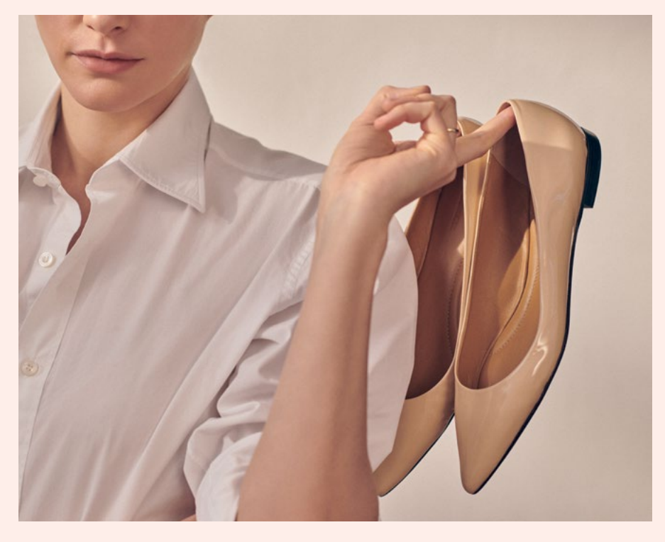
BALLERINA Coated Calfskin, Nude D 8811-LE