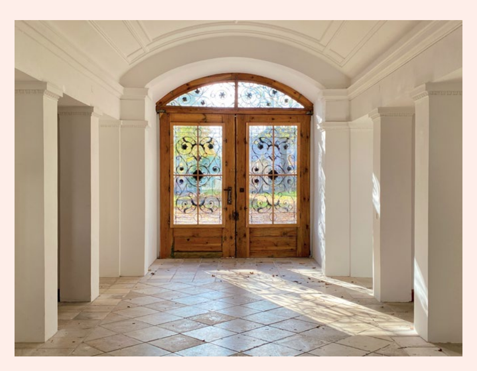
More information about Süßenbrunn Castle on www.schloss-suessenbrunn.at

We invite you to visit Süßenbrunn Castle and take a look through the keyhole.