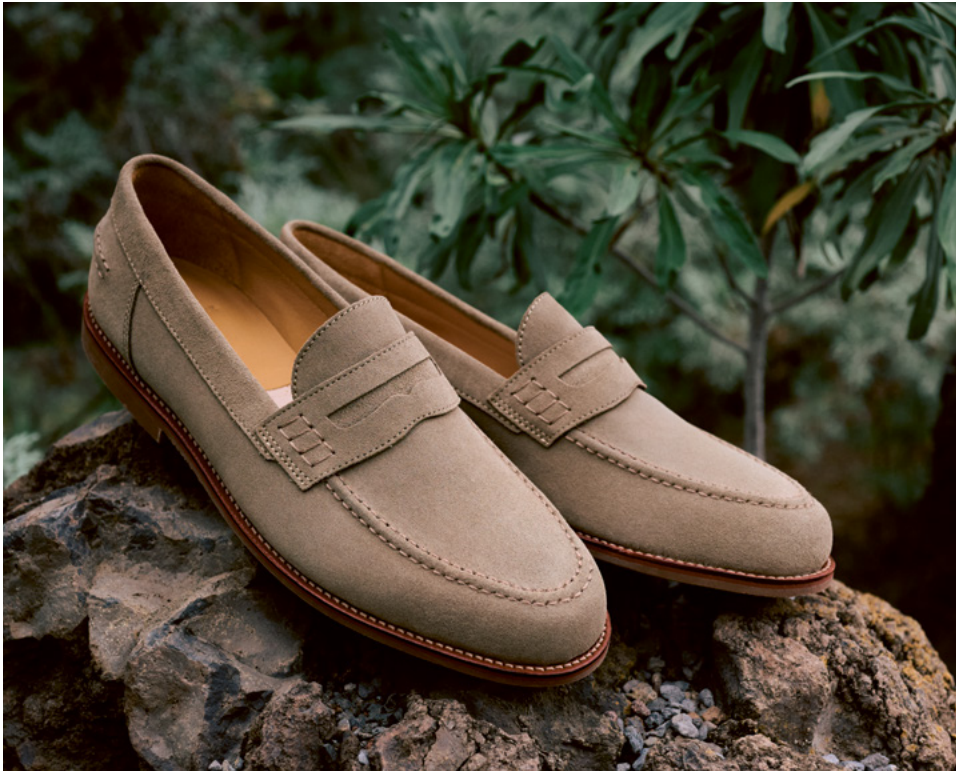
COLLEGE LOAFER Hydrosuede, Taupe, Loafer Last R 49-VWT.LN-2A-KC

Our new College Loafer graduates from a timeless icon. With contrast stitching and hand detailing, it doesn't disrupt style – it refines a founding model. A tribute to sustainable materials and artisanal expertise, perfect for those who blur the lines between work and leisure. Whether strolling the halls of academia, navigating a conference, or finding yourself impeccably yet impractically dressed for a spontaneous hike, the College Loafer remains a sophisticated companion – effortlessly, if not entirely intentionally, stylish at every step.