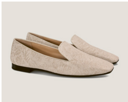
MIMI Leitner Leinen Fleur Royale D 8825-TME

The sophisticated Mimi slipper, named after Puccini's most heartbreakingly stylish heroine, takes inspiration from Venetian palazzo slippers – effortlessly elegant, refreshingly unadorned, and always ready for a dramatic exit. Meanwhile, the Marina bag – rooted in the timeless drawstring design – beckons summer voyages, tropical discoveries, and room enough for a stylish stowaway.