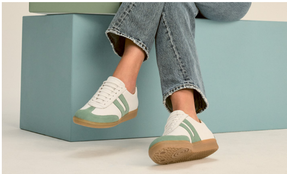
TURQUOISE T 515-GHP-VNLC