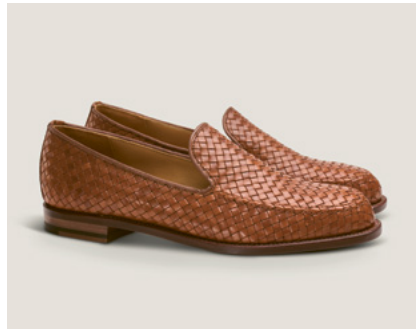
WOVEN LOAFER Woven Leather, Cognac R 45-FWC.LC-3-2