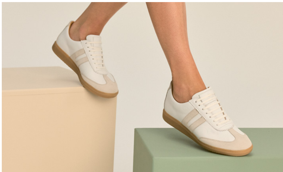
ÉCUME T 515-GHP-VWE.C