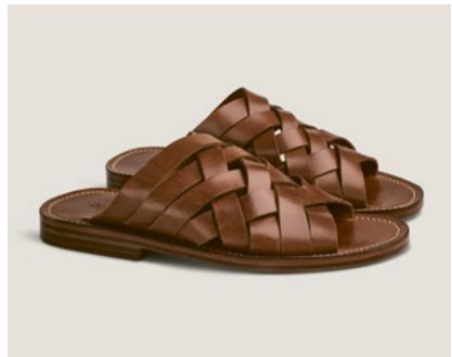
PERSEUS Vintage Pullup, Cognac S 668-RPC