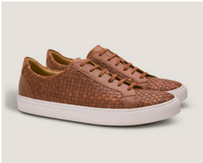
WOVEN TENNIS Woven Leather, Cognac T 560-FWC

For centuries, Fermo has been a stronghold of artisanal excellence, where cottage industries thrive in hilltop towns and villages. Weaving, and leather-work have long been integral to the region's cultural identity, sustaining communities that live and work in symbiotic harmony.