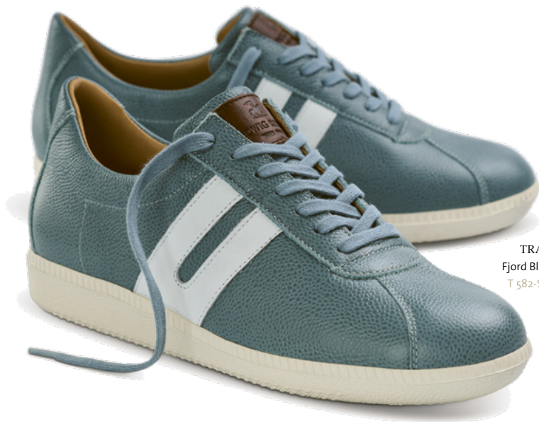
TRAINER Fjord Blue / White T 582-SWB-GHP

While our trainers are handcrafted by actual people and not the forces of nature, our latest colorway is inspired by one of nature's greatest masterpieces – the Scandinavian fjords. These breathtaking formations take thousands of years to shape through ice, rock, and patience.