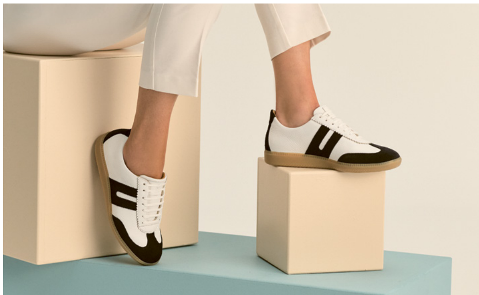
NAVY T 515-GHP-VWN.C