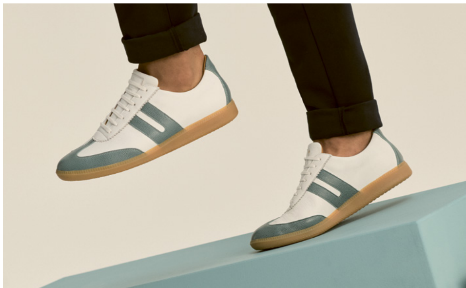
FJORD BLUE T 515-GHP-SWB.C