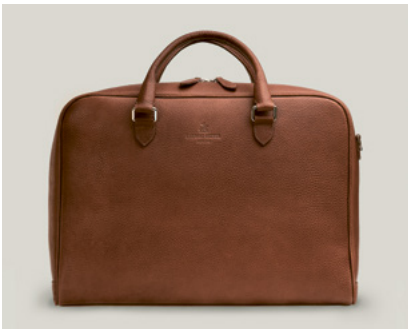
DIRECTORS BAG Country Calf, Mahogany N T545-GPM

Great directors find inspiration everywhere – especially at the bar. Between stolen glances and swirling glasses, ideas take shape. Our penny loafer, in box calf leather, develops a storied patina over time – its smoky tones mirroring the dark spirits behind the counter. The Director’s Bag, in mellow country calf, holds everything but the script – ensuring your production travels with you. Whether you’re people-watching or plot-twisting, some classics never go out of style.