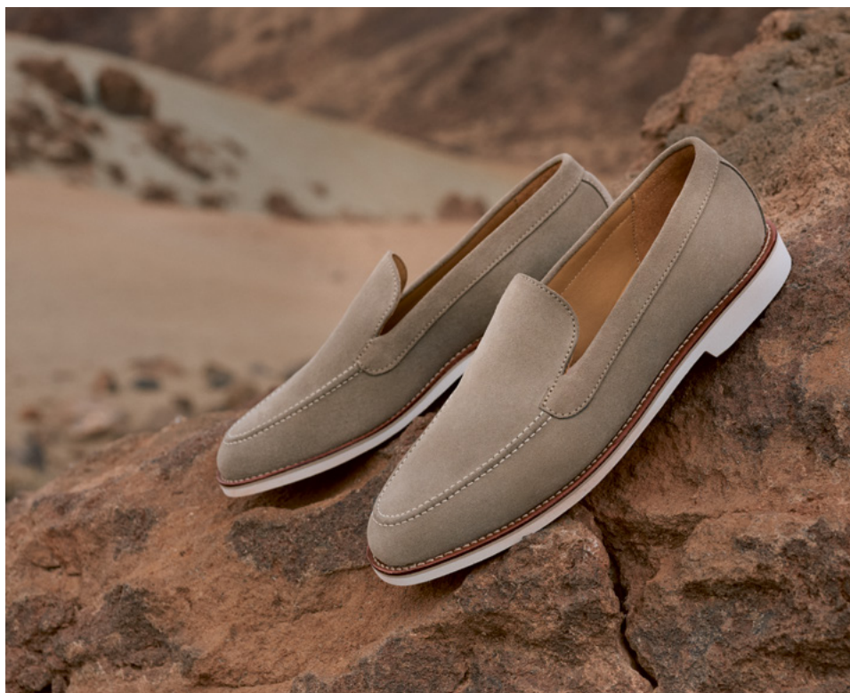
CAPRESE Hydrosuede, Taupe, Tuscan Last S 409-VWT-CP

The Caprese embodies the effortless elegance of la dolce vita – a loafer that speaks of serenity and laid-back luxury. Handmade from the finest natural materials, its lustrous suede captures the warmth of the sun-drenched Mediterranean. Light yet full of thoughtful details, it moves effortlessly from cobbled streets to sunlit terraces, slipping off with ease when it's time to come down and ground your feet in the earth.