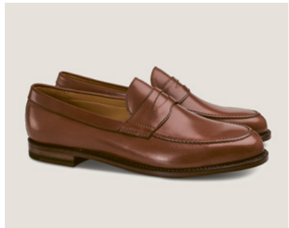
PENNY LOAFER Box Calf, Maron, College Last R 41-BNM.LC-3-2