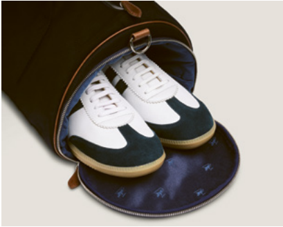
SMALL CRICKET BAG Nylon, Vintage Pullup, Navy N T572-TNN

For centuries, Grand Tour travelers roamed Italy in search of manly pursuits, imperial glory, and the perfect espresso. They dueled with words, wrestled with ideas, and occasionally tripped over ancient ruins. Designed for the modern athlete, our cricket bag carries that same spirit of adventure – whether you’re chasing goals or just chasing your train. Like the citadels of Marche, it’s built to endure, a steadfast companion for those who seek tradition, triumph, and, when the day is done, a very high thread count.