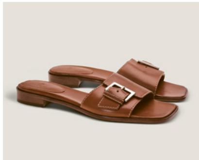
SALOME Vitello, Cognac D 8722-BC

Unfortunately, during the time of King Herod, there were no Ludwig Reiter shoes (at least nothing has been discovered). Otherwise, his stepdaughter probably wouldn't have come up with that gruesome wish, which famously cost the poor prophet John the Baptist his head. Instead, after the undoubtedly tiring veil dance, she might have wished for these wonderfully comfortable sandals made from the finest Italian calf leather. Therefore, dear men: if you want to keep your head, don't skimp on your daughters' shoes!