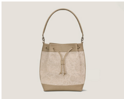
MARINA Leitner Leinen Fleur Royale, Grain Dauphin, Taupe N T755-TME-GDT