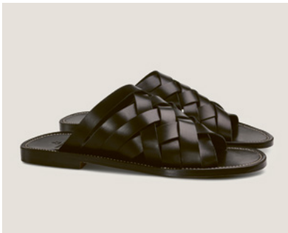
PERSEUS Vintage Pullup, Black S 668-RPS

Perseus soared on winged sandals, defying fate with every step. Our black woven leather sandal, a modern talaria, rests at the edge of possibility – where sky meets sea, where body meets earth. As the hero faced his trials, so too does this sandal embrace the terrain, weaving strength and elegance into every stride. Let the wind whisper myths beneath your feet, the ocean shimmer with untold stories, and each step echo with power, grace, and timeless adventure.