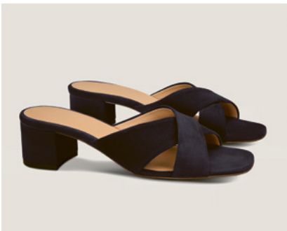
AIDA Suede, Navy D 8753-VN