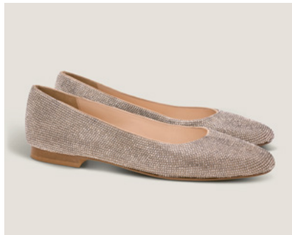
SCALA Cristallo, Silver D 8800-AQ

Like a sparkling smile beneath golden stage lights, the Scala ballerina catches every glimmer in the room. Our crystal-coated slipper is inspired by the legendary Milanese Scala Opera House, where stars have shone brightly for centuries. Whether you're a prima ballerina or a prima donna these slippers honor a legacy of art, music, and refined elegance, with their shimmering surface capturing every bit of the limelight.