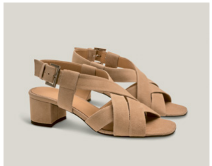
PENELOPE Suede, Beige D 8754-VE