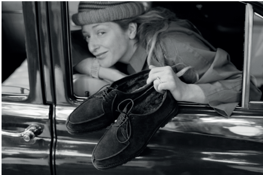
KEEP CALM AND STAY WARM , SUEDE, ANTHRACITE, LAMBSKIN LINING, VIENNESE LAST, GOODYEAR WELTED, ULTRALIGHT PROFILE SOLE, S.18-VLA-PY.DW-2Z-ES