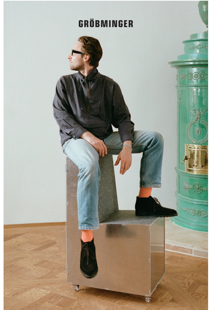
NORWEGER-CHUKKA BOOT-HYBRID, SUEDE, UMBRA, TUSCAN LAST, GOODYEAR WELTED, ALL-TERRAIN SOLE, R.69-VTU.TGS-2Z-GJ