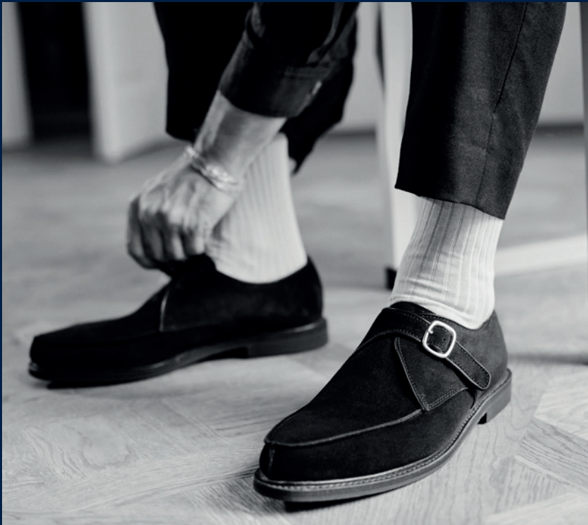
SUEDE, UMBRA, SALZBURG LAST, GOODYEAR WELTED, CRÊPE SOLE, R.2.58-VTU.RF-2Z-KS