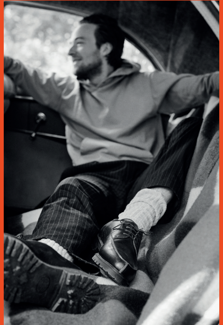
LIEBLINGS-PIECE , BARK-TANNED LEATHER, MOCCA, LAMBSKIN LINING, SALZBURG LAST, GOODYEAR WELTED, CORRUGATED SOLE, S.18-UBD-PY. RG-2Z-GR